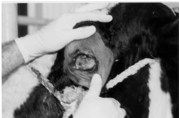
Fig. 1: The eye of the cow is affected by inflamed, abnormal tissues

Histopathologic findings revealed the accumulation of foamy macrophages in deep dermis. These full fill fat histiocytes possessed one nucleus, but there was not remarkable fibrosis (fig.2). Microscopic studies confirmed the absence of cholesterol clefts in tissue slides, therefore, xanthelasma was diagnosed. To this time, the disease has not been returned.