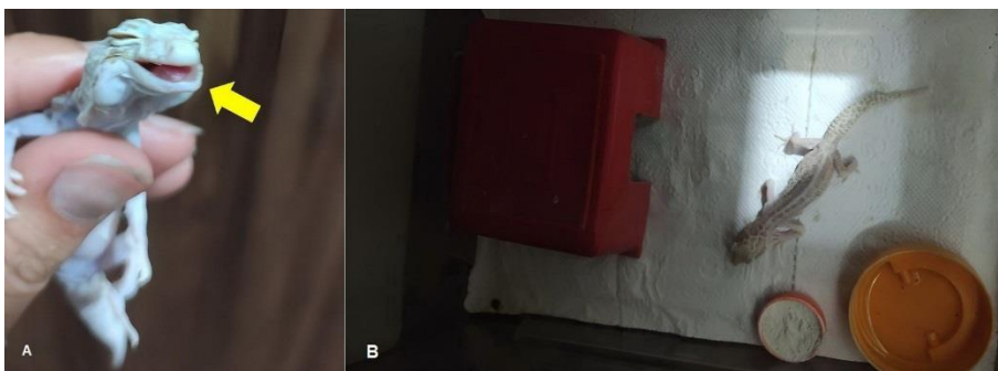
Figure 1. (A) The arrow indicates the mandibular deformity of the leopard gecko caused by MBD. (B) The leopard gecko's vivarium with inappropriate lighting, heating, and humidity conditions.

When 7-dehydrocholesterol (provitamin D 3 ) in the skin is exposed to radiation with a wavelength between 280 and 315 nm (UV-B rays), it is converted into pre-vitamin D 3 . 5 Pre-vitamin D 3 is, in turn, converted to cholecalciferol (vitamin D 3 ) via temperature-sensitive isomerization. 1 Vitamin D 3 is then transported to the liver and converted to 25-hydroxycholecalciferol (calcidiol). Further hydroxylation occurs in the kidneys, where calcidiol is converted to the active hormonal form of vitamin D 3 , calcitriol (1,25-dihydroxycholecalciferol), which is needed to absorb dietary calcium. 5,1 The owner mistakenly believed that because the leopard gecko is nocturnal, there is no need for UV light. However, it has been documented that predominantly nocturnal lizards may also require UV-B radiation, but require less UV-B exposure to produce similar levels of vitamin D 3 compared to diurnal species. 4 Indeed, evolutionary adaptations in species with less opportunity for sunlight exposure (e.g., nocturnal reptiles) develop a more sensitive and efficient mechanism to synthesize vitamin D from UV-B. 5,6 A study conducted by Gould et al. (2018) confirmed that leopard geckos that are exposed to UV-B rays for a short period (2 hours) can significantly increase their calcidiol concentration compared to geckos that are not exposed to UV-B but are fed the same diet. Also, these authors suggested that leopard geckos maintained on a