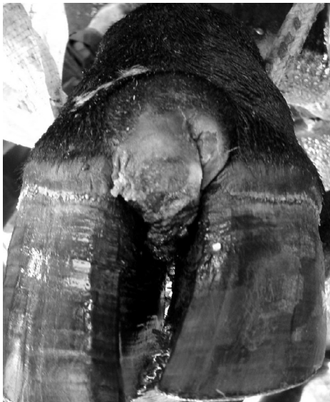
Figures 3 & 4

The two wires are tied together to keep the digits close to each other. A pressure bandage of cotton wool drenched in peroxide is applied. It is not necessary to administer systemic antibiotics.