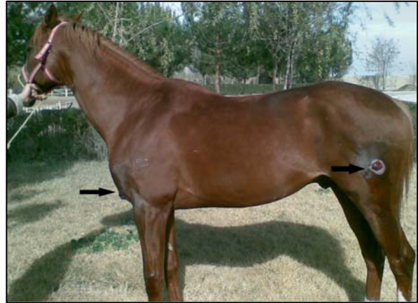
Figure 1. Two neoplastic masses (arrows)

An 8-years-old, light brown and crossbred stallion presented with two firm and gray-colored skin masses on his left thigh and thoracic inlet with a slow growth since two years ago. They were irregular in shaped with some convex parts, measuring 5.0 \times 7.0 \times 12.0 cm (Fig. 1). Surface bleeding had been reported occasionally. The masses were palpated quite intradermal with no subcutaneous tissue involvement. The general clinical examination of the animal, including heart rate, respiratory rate and rectal temperature revealed no problem. CBC and WBC count were normal.