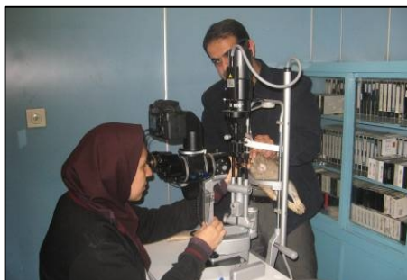
Figure 1. slit lamp biomicroscope examination of the rabbit eye

Twelve matured and immature (9mature, 3immature) domesticated rabbit weighing between 600 to 1500 gram of both sexes (6male, 6female ) were collected and kept for one week prior to experiment For being clinically healthy. Radiographs were taken of skeletal system of all rabbits for determination of statue of the growth plate. All eyes were examined by ophthalmoscope and slit lamp biomicroscope on non-anaesthetized rabbit (fig 1). Only atropine was applied half an hour before examination for production of mydriasis (fig 2).