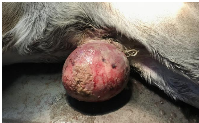
Figure 1. Evisceration of umbilical content with extensive adhesion

Twenty days old indigenous male bovine calf was brought to Veterinary Teaching Hospital, Bangladesh Agricultural University, Mymensingh, Bangladesh having body weight